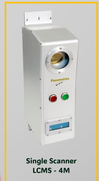
Single Scanner LCMS - 4M